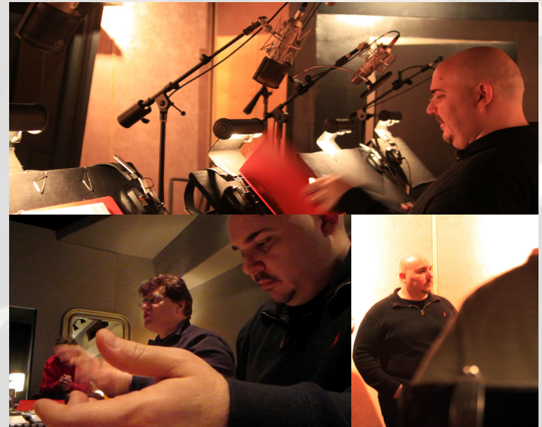
SON of the STORM Page 11