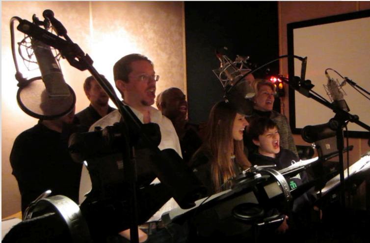
SON of the STORM Page 18

and Marcello ( La Boheme ) with Opera Company of Middlebury; the title role of Don Giovanni and Enrico ( Lucia di Lammermoor ) with Dell'Arte Opera; Iago ( Otello ), Nabucco ( Nabucco ), Scarpia ( Tosca ), and Zurga ( Les pecheurs de perles ) at Taconic Opera.