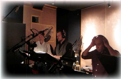
SON of the STORM Page 16