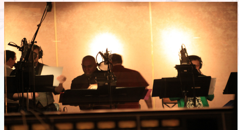
SON of the STORM Page 17