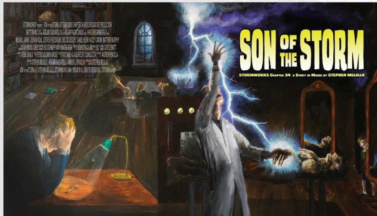
SON of the STORM Page 26