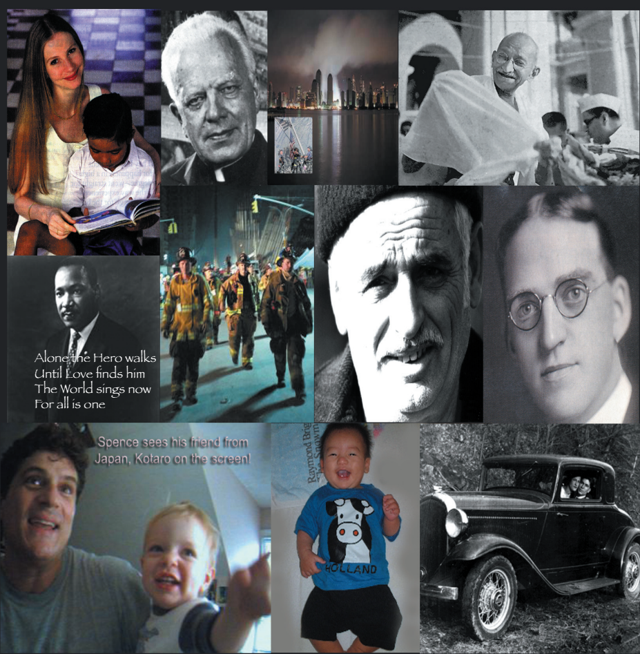
Alone the Hero walks Until Love finds him The World sings now For all is one